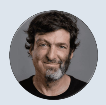
Dan Ariely Behavioral Economist, Co-Founder, Irrational Capital

The Index consists of a modified market capitalization-weighted portfolio of equity securities of approximately 150 U.S. companies identified by Irrational Capital LLC ("Irrational Capital") as those it believes to possess strong corporate culture based on its proprietary scoring methodology. The Index was developed by the Canadian Imperial Bank of Commerce (CIBC, the "Index Provider").